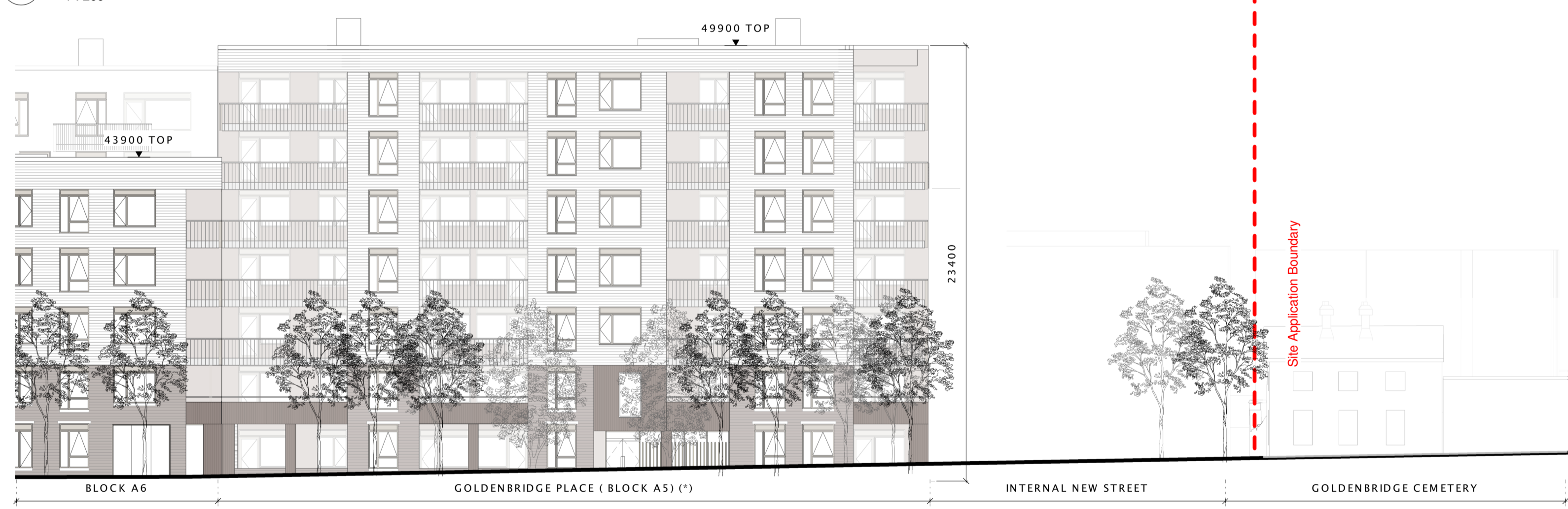
3 CONTEXTUAL ELEVATION - WEST (ST. VINCENT STREET WEST) 3/3