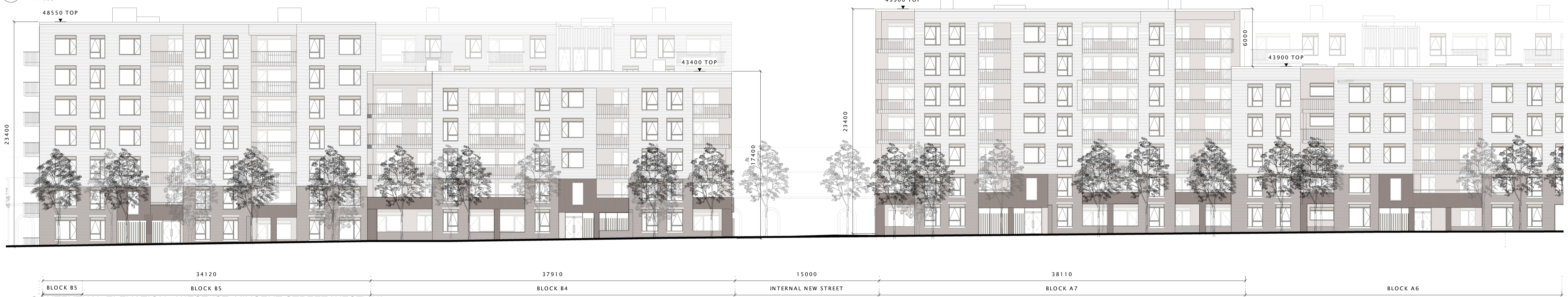
2 CONTEXTUAL ELEVATION - WEST (ST. VINCENT STREET WEST) 2/3